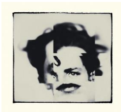
J. Fredric May Authors Hallucination #3 "Les" , 2018 Archival Pigment Print with pencil. 20 x 20 inches