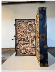
Krista Machovina A Lot to Unpack , 2023 Found trunk and wood pieces 36 x 22 x 26 inches