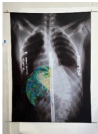
Bhavna Mehta I Found a River in My Body #3 , 2023 Silk Fabric, silk threads, iron rods 52 x 42 inches