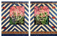
Dylan Mortimer Gates in Proximity to Paradise , 2023 Cut paper, paint and glitter on panel 65 x 48 x 1 inches, each