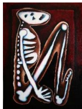
Ted Meyer Structural Abnormalities , 1987 Oil on Canvas 48 x 36 inches